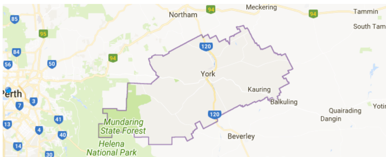
Figure 1: Map of the Shire of York

The Shire of York stretches over 213,159 hectares (2,131km 2 ) and was the first inland settlement in Western Australia. It is situated within the Wheatbelt region of Western Australia and is one of the major wheat producing areas in Australia. The Shire is bounded by the Shires of Northam and Cunderdin to the north and northeast, Quairading to the east, Beverley to the south, and Mundaring and Kalamunda to the west. Its key townships are York, Gwambygine, Mount Hardey, Greenhills, and Kauring.