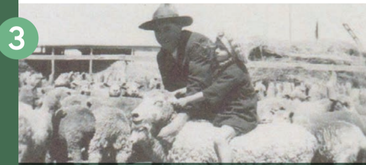
Near Greenhills Inn