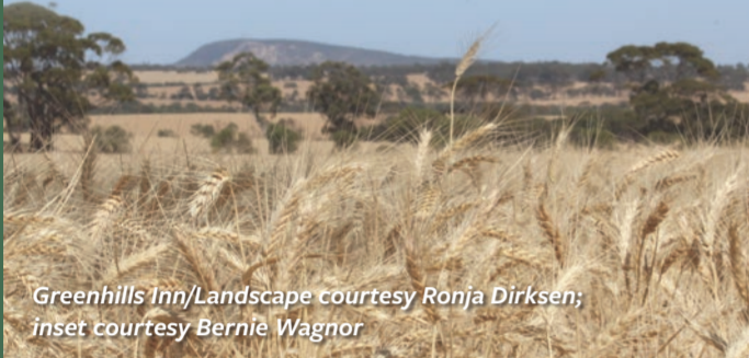
Greenhills Inn/Landscape

Take a break and rest in the shade of the gazebo – you'll find more interesting stories there.