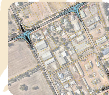
LIGHT INDUSTRIAL AREA UPGRADES: DESIGN PHASE