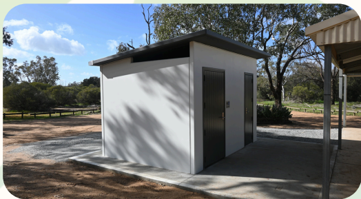
ORV ACCESSIBLE TOILETS