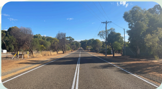
ROAD SAFETY IMPROVEMENTS