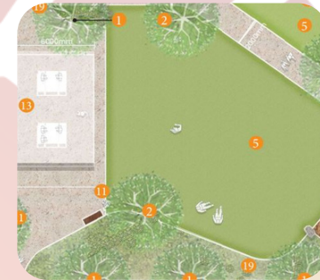
MACARTNEY ST GREEN SPACE: CONSTRUCTION