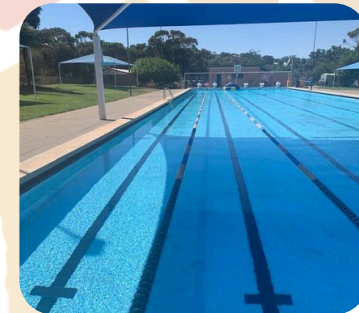
AQUATIC FACILITY RENEWAL: DESIGN PHASE