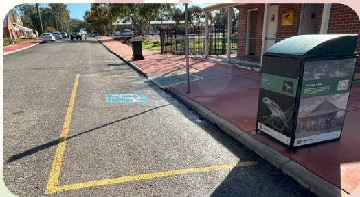
ACCESSIBLE FOOTPATHS: HOWICK STREET