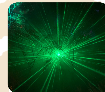
WAUGAL RISES: BALLARDONG CULTURAL PROJECT