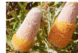
Banksia prionotes Orange flowers in autumn, winter & spring. Also known as Acorn Banksia due to the cones becoming orange from the bottom up.