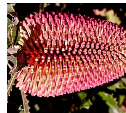
Banksia caleyi . Bushy shrub, 0.6-2 m high. Flowers are red/pink & cream, Sept to Jan. Cones hang downwards and are partially concealed by the foliage.

Acacia sessilispicca Banksia attenuata B. prionotes Calothamnus rupestris Eucalyptus caesia subsp. caesia E. eremophila E. drummondii E. forrestiana Hakea preissii H. pandanocarpa H. victoriae H. scoparia Leptospermum erubescens L. nitens Melaleuca macrorychia M. lateriflora M. thyoides M. uncinata Viminaria juncea