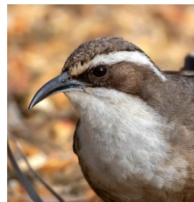
White-browed Babblers form monogamous pairs that build a dome-shaped nest with a hooded side entrance.