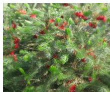
Calothamnus quadrifidus or One-sided Bottlebrush attracts honeyeaters to its red flowers over Spring-Summer.