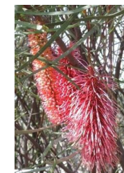
Hakea francisiana or Emu Tree, flowers from July to Oct. The nuts are favoured by Carnaby's black cockatoos