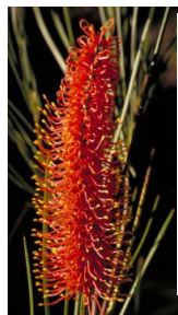
Hakea bucculenta or Red Pokers, is a great screening plant that attracts nectar feeding birds during Winter-Spring.