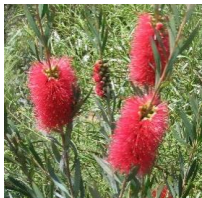
Callistemon phoeniceus (Lesser Bottlebrush) is a local species noted for its bright red terminal bottlebrush flowers. Flowering times are Sept to Dec.