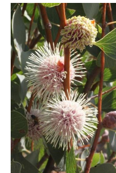
Hakea petiolaris or Sea urchin hakea grows to 3m high and flowers from June-Sept. Drought tolerant once established.