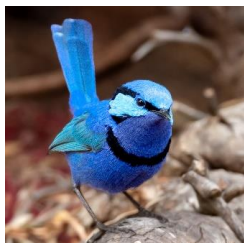
Splendid Fairy-Wren. Males are blue. Matriarch runs a communal group.