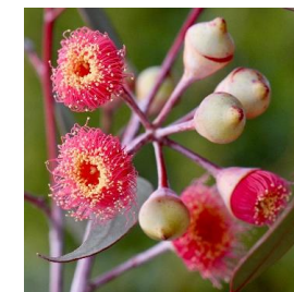
Eucalyptus caesia subsp. caesia A mallee growing to 10m with miniritchie bark and flowers with pink filaments & yellow anthers in June, July & Sept