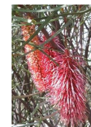
Hakea francisiana or Emu Tree, flowers from July to Oct. The nuts are favoured by Carnaby's black cockatoos