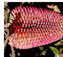
Banksia caleyi . Bushy shrub, 0.6-2 m high. Flowers are red/pink & cream, Sept to Jan. Cones hang downwards and are partially concealed by the foliage.

Acacia sessilispicca Banksia attenuata B. prionotes Calothamnus rupestris Eucalyptus caesia subsp. caesia E. eremophila E. drummondii E. forrestiana Hakea preissii H. pandanocarpa H. victoriae H. scoparia Leptospermum erubescens L. nitens Melaleuca macrorychia M. lateriflora M. thyoides M. uncinata Viminaria juncea