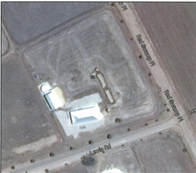
Site Plan (Google 2016 – shows constructed dwelling on lot)