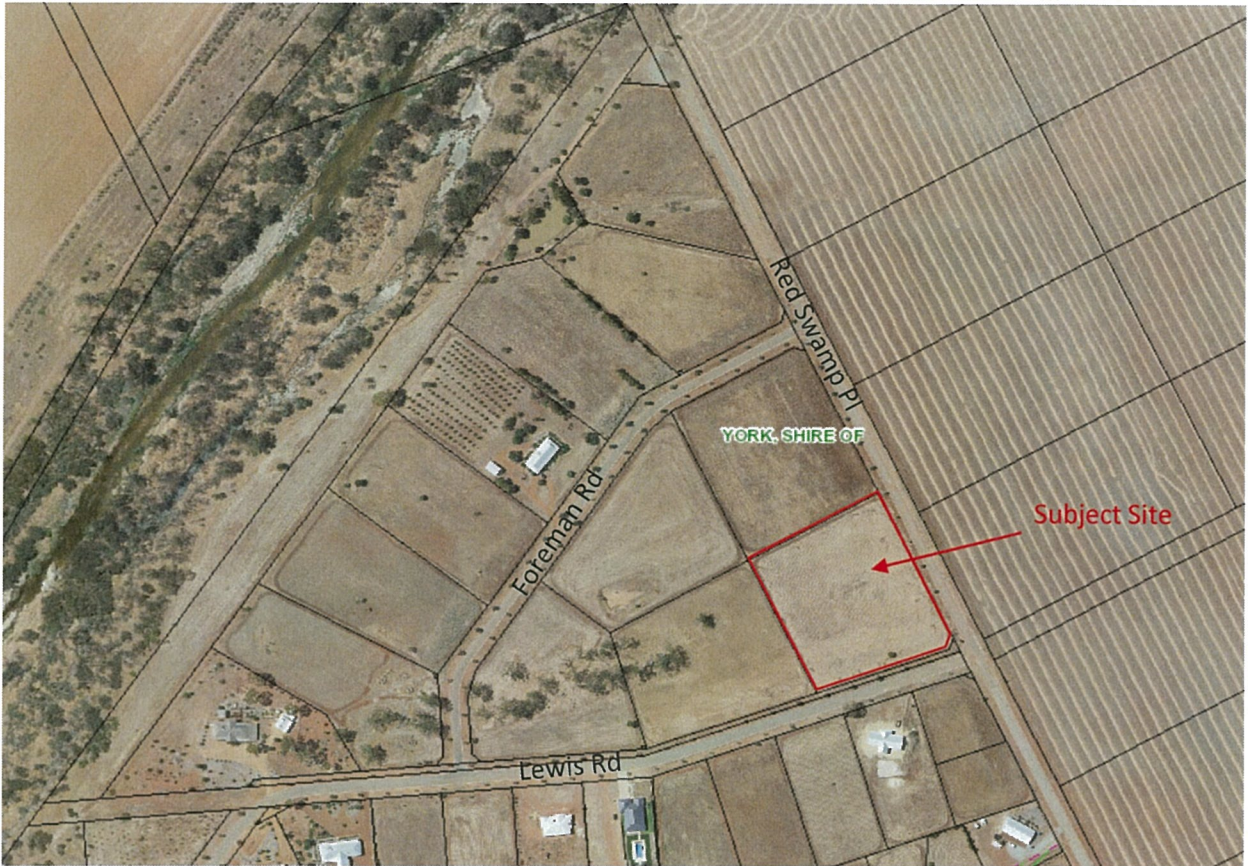
Site Plan