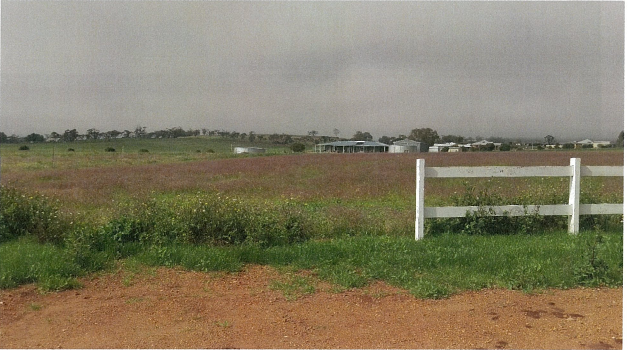
4. View of the Property from the north at Foreman Road