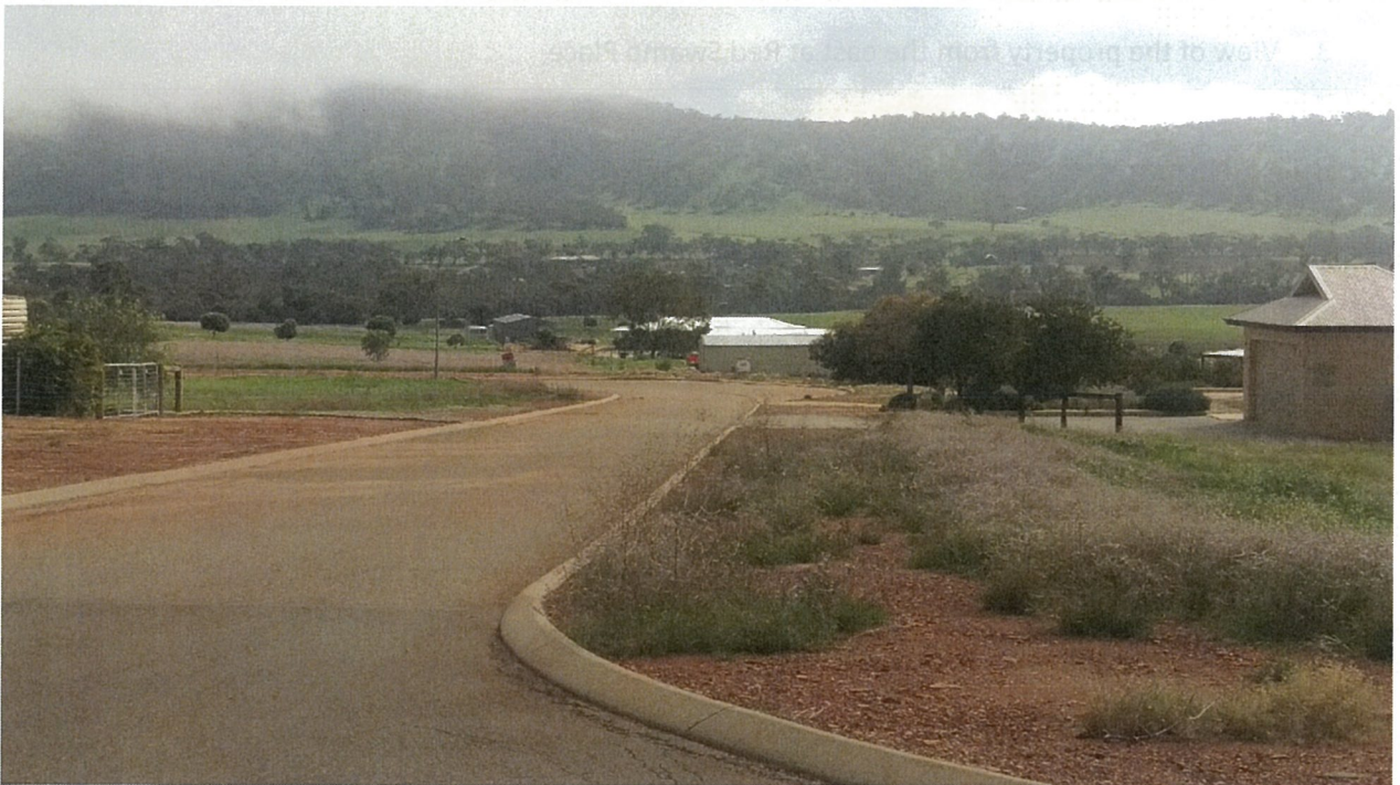
2. View of the property the south at Langford Avenue