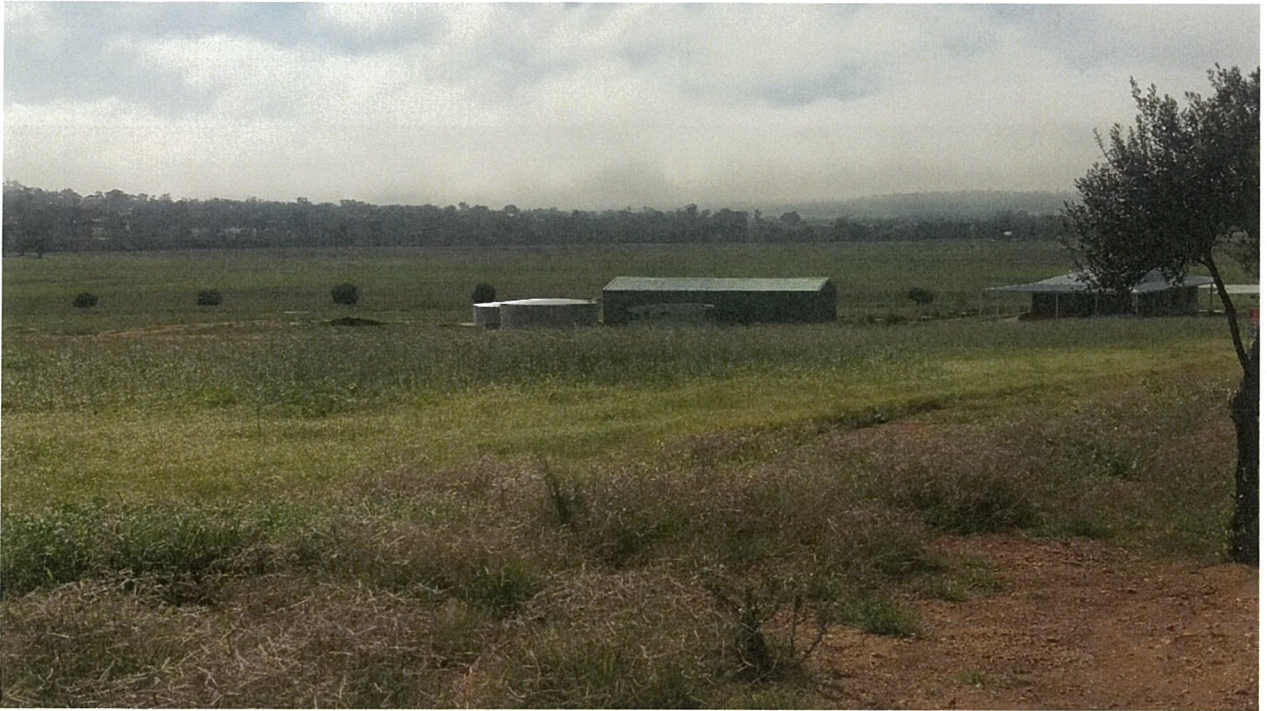
1. View of the property from the west at Lewis Road