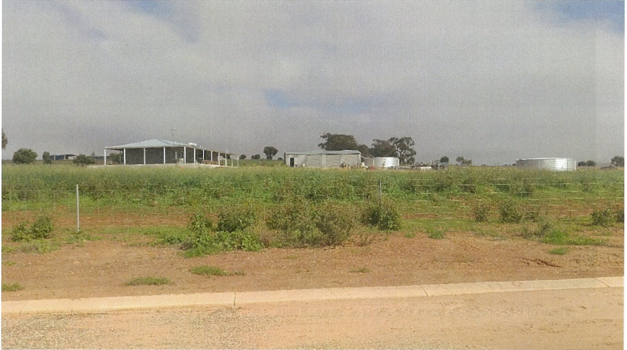
3. View of the property from the east at Red Swamp Place