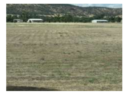
Compliant Hazard Reduction