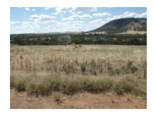
Non-Compliant Hazard Reduction

2.1m firebreak around every 300ha block and all building, fuel, haystacks and drums.