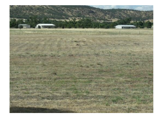
Compliant Hazard Reduction