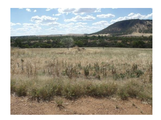
Non-Compliant Hazard Reduction

2.1m firebreak around every 300ha block and all building, fuel, haystacks and drums.