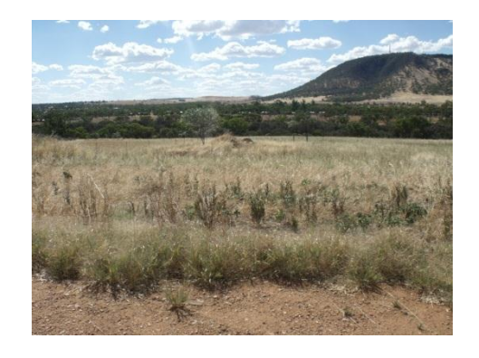
Non-Compliant Hazard Reduction

2.1m firebreak around every 300ha block and all building, fuel, haystacks and drums.