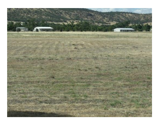
Compliant Hazard Reduction