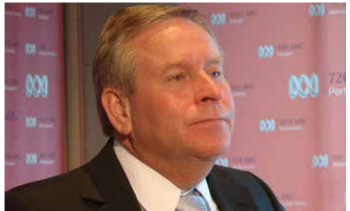
West Australian Premier Mr Colin Barnett

The threat of "do nothing and you will be forced into amalgamation not of your choosing" has serious implications for the future sustainability of Rural Councils. Funds currently available to the four RTG Councils for Transition, valued at $2.95