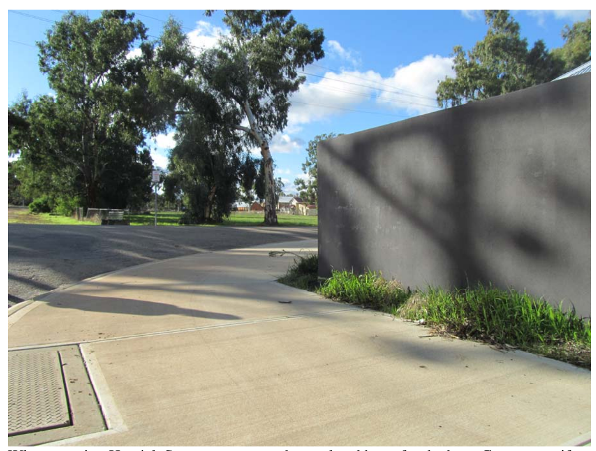
When crossing Howick Street users cross the road and hope for the best. Can not see if cars are coming at all.