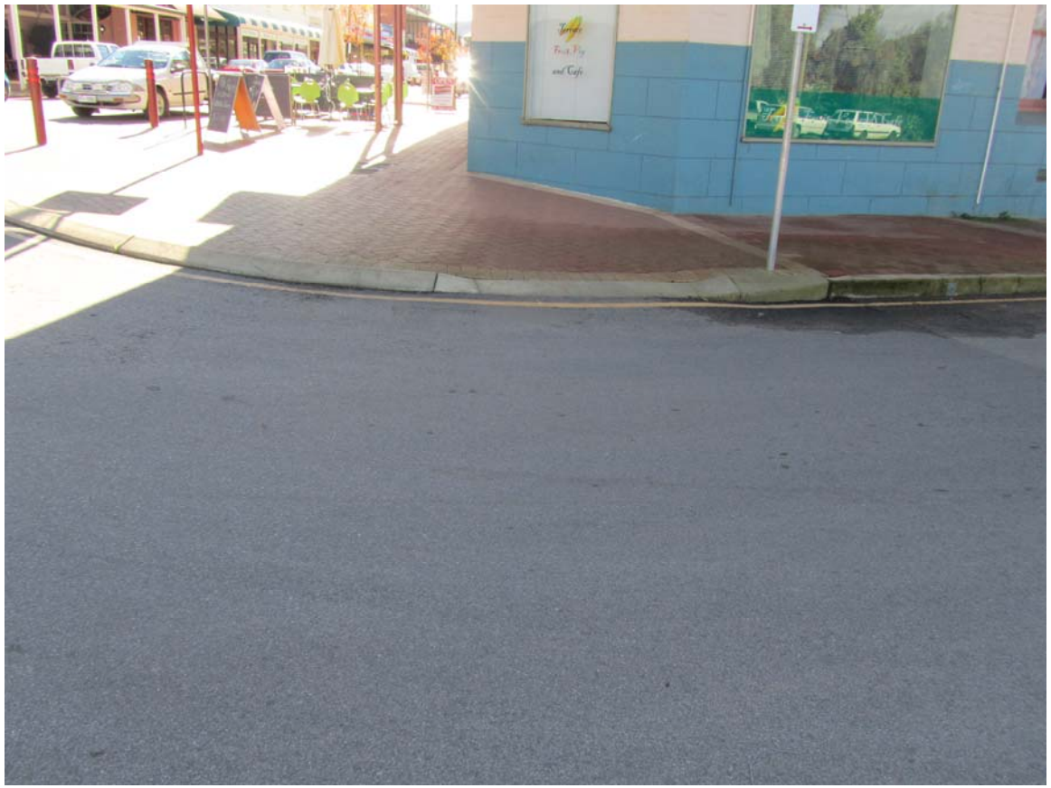
The ramp is in the wrong position and does not line up with the ramp that is needed on the other side of the road.