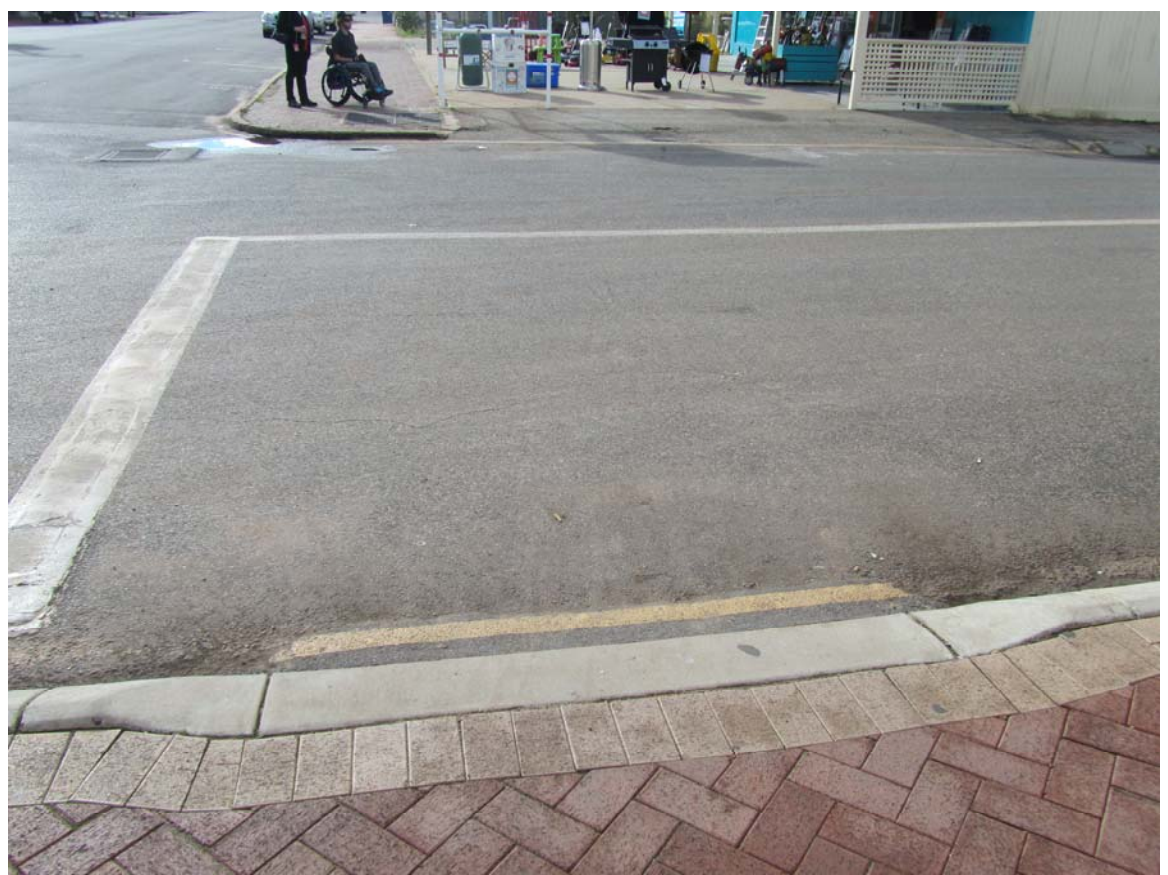
This ramp is okay.