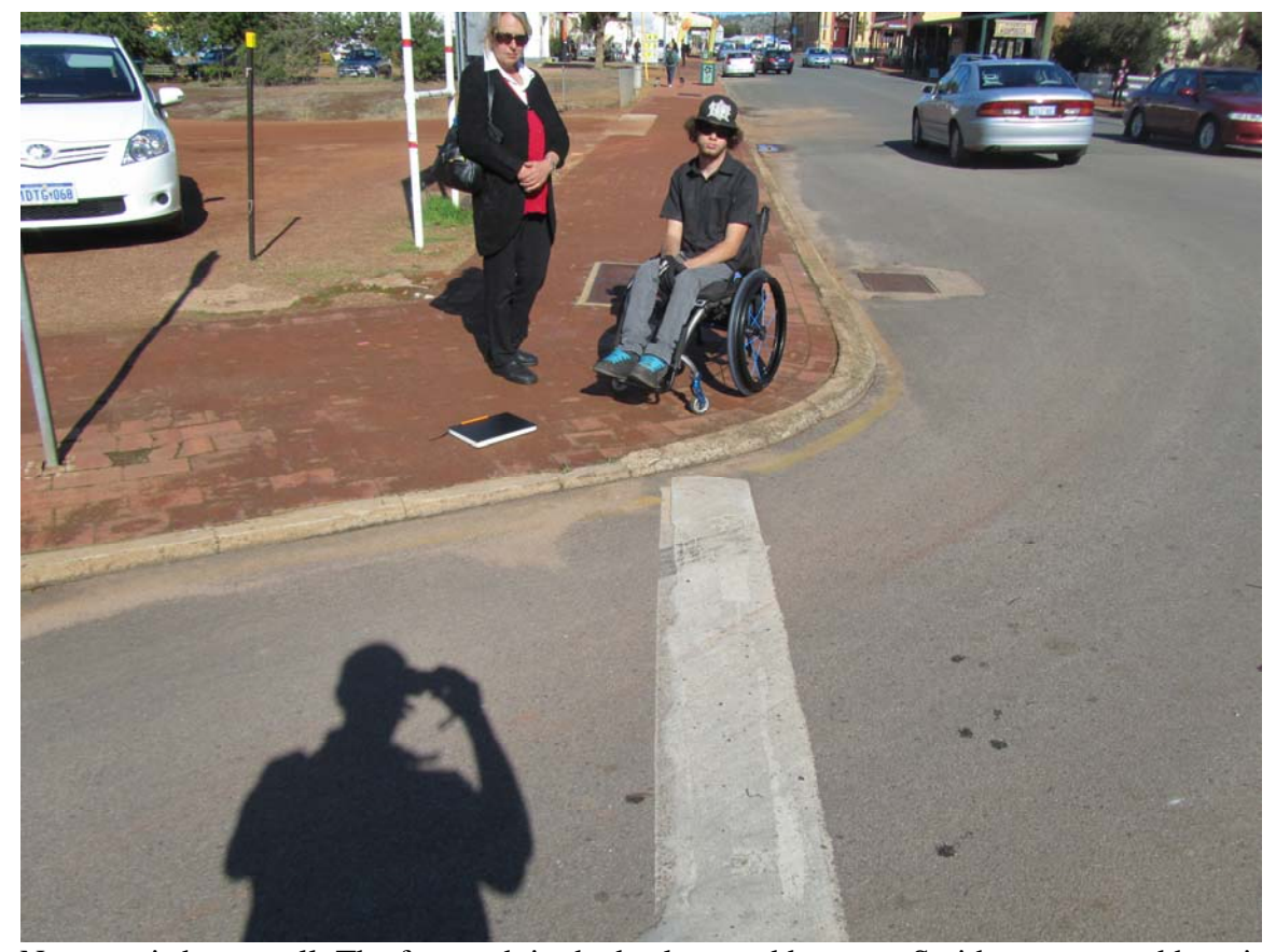
No ramp is here at all. The foot path in the background between Smiths garage and here is uneven in many place and has numerous trip hazards.