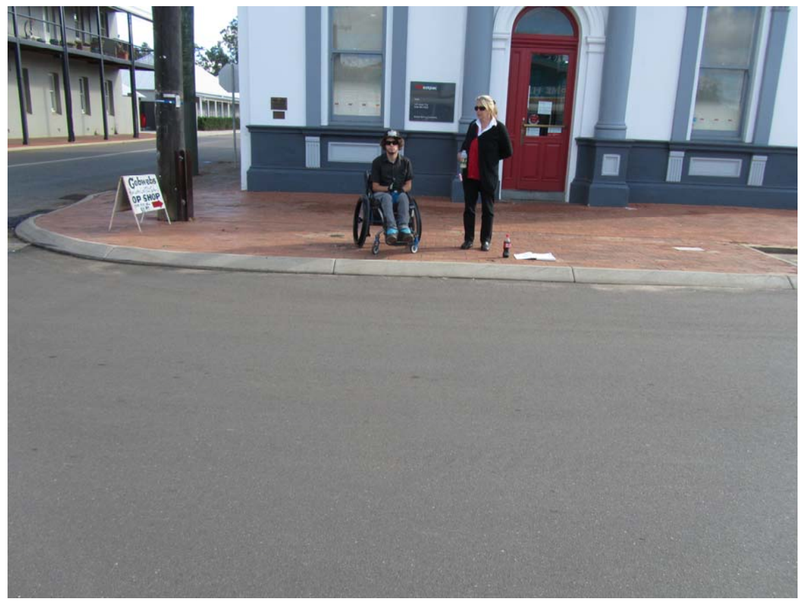
Nice big nib but no proper ramp. Kerbing too steep.