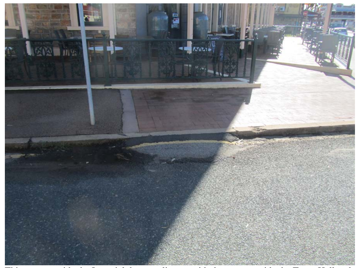
This ramp outside the Imperial does not line up with the ramp outside the Town Hall and is approx 6 meters from Avon Terrace. It is also of poor design and non compliant.