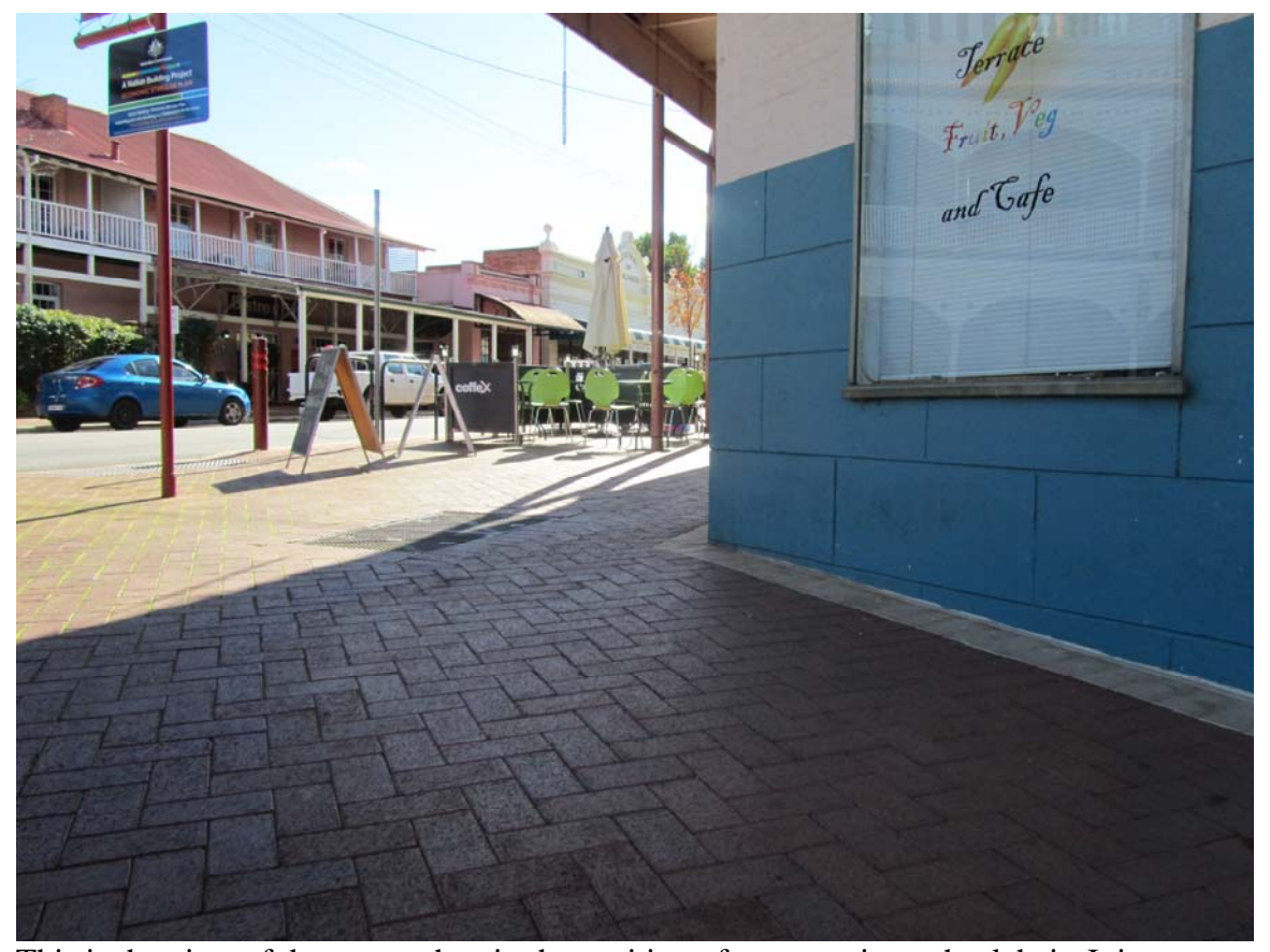
This is the view of the ramp when in the position of a person in a wheelchair. It is very difficult to see if cars are going to turn.