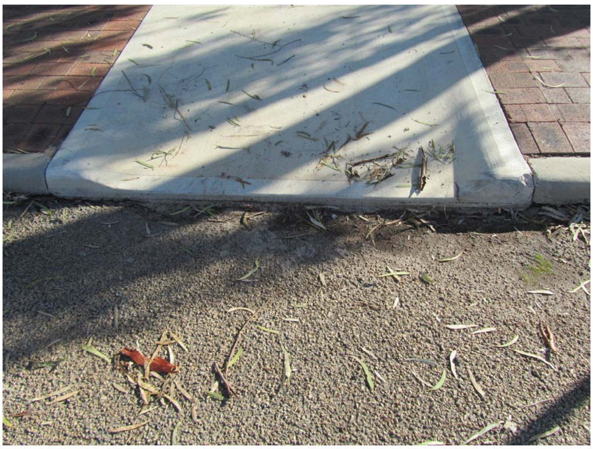
Lip this side of Howick Street is approx 80mm. Also unable to be used by a person in a wheelchair.