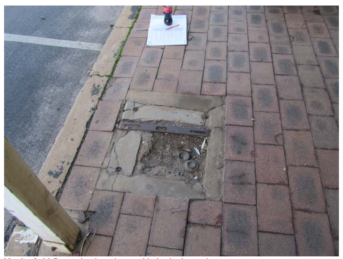
North of old fire station has pipes and holes in the paving.