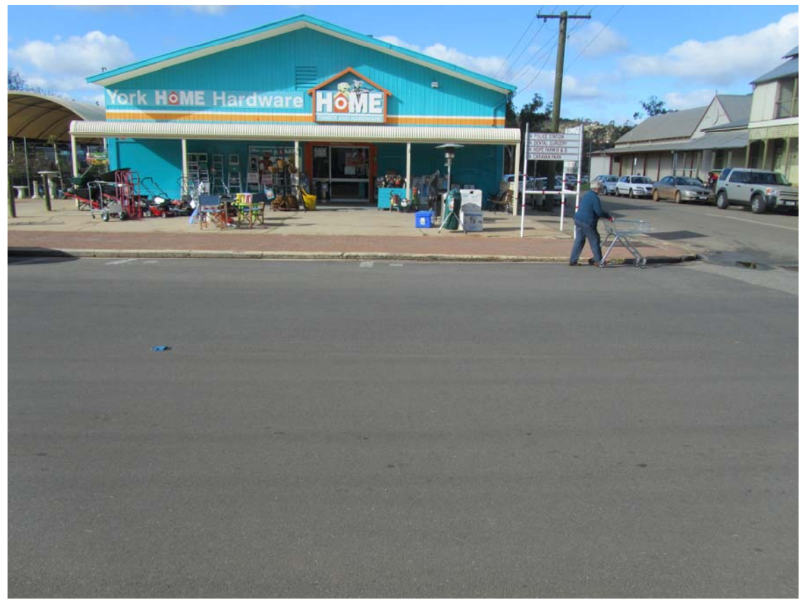
No ramp has been installed.