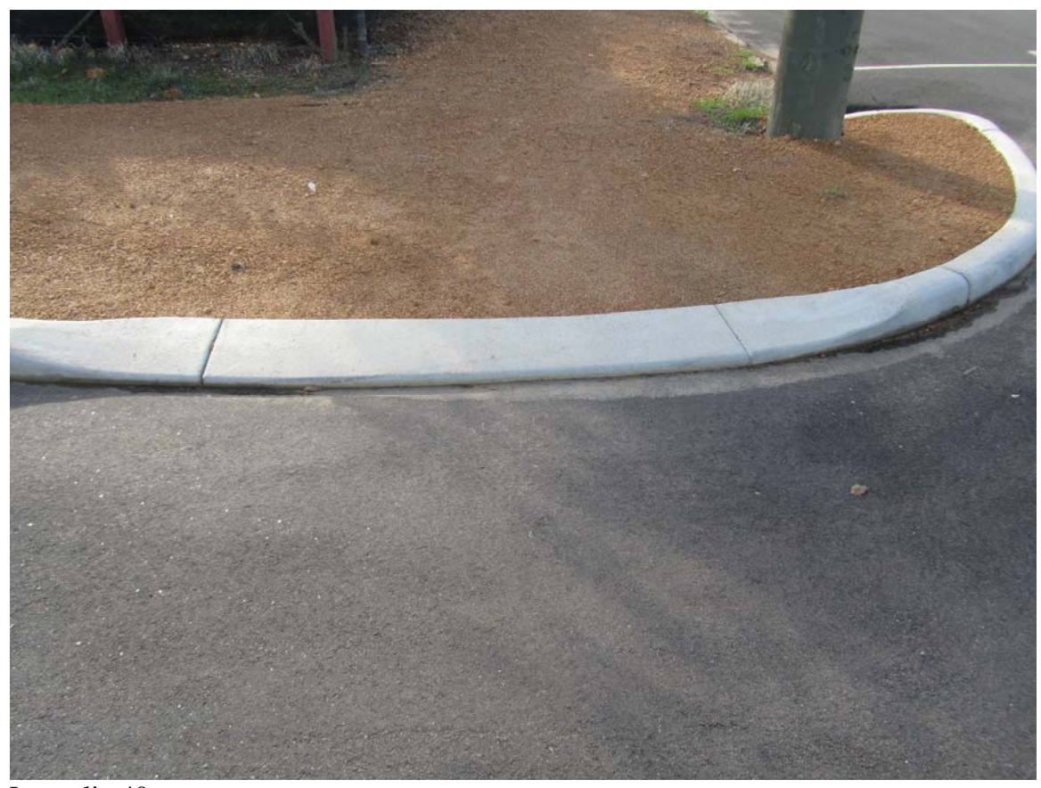
Large lip 40mm.