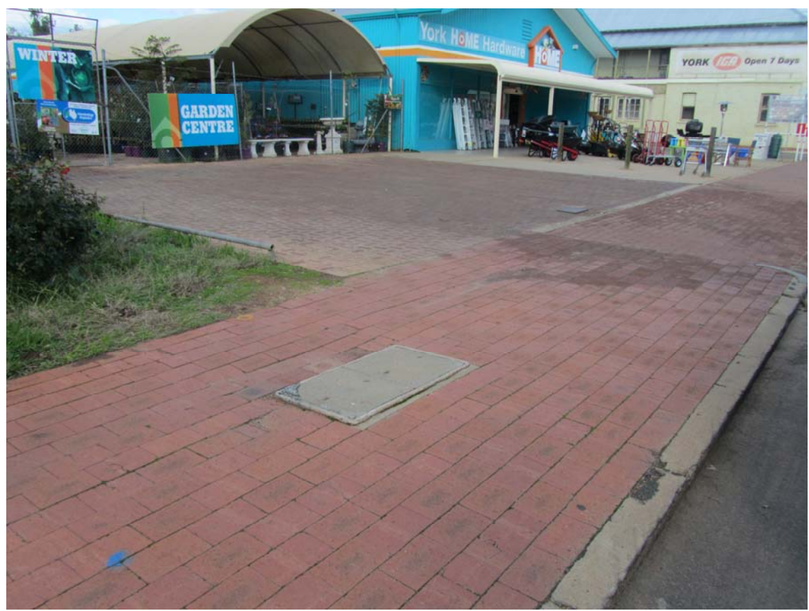
This cover is above the footpath approx 40mm.