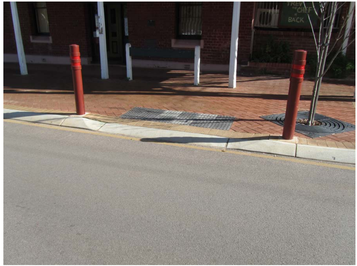
This is an example of what the crossings should look like.