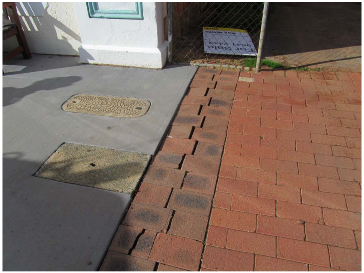
Paving north of vet before joining concrete footpath is loose and uneven.