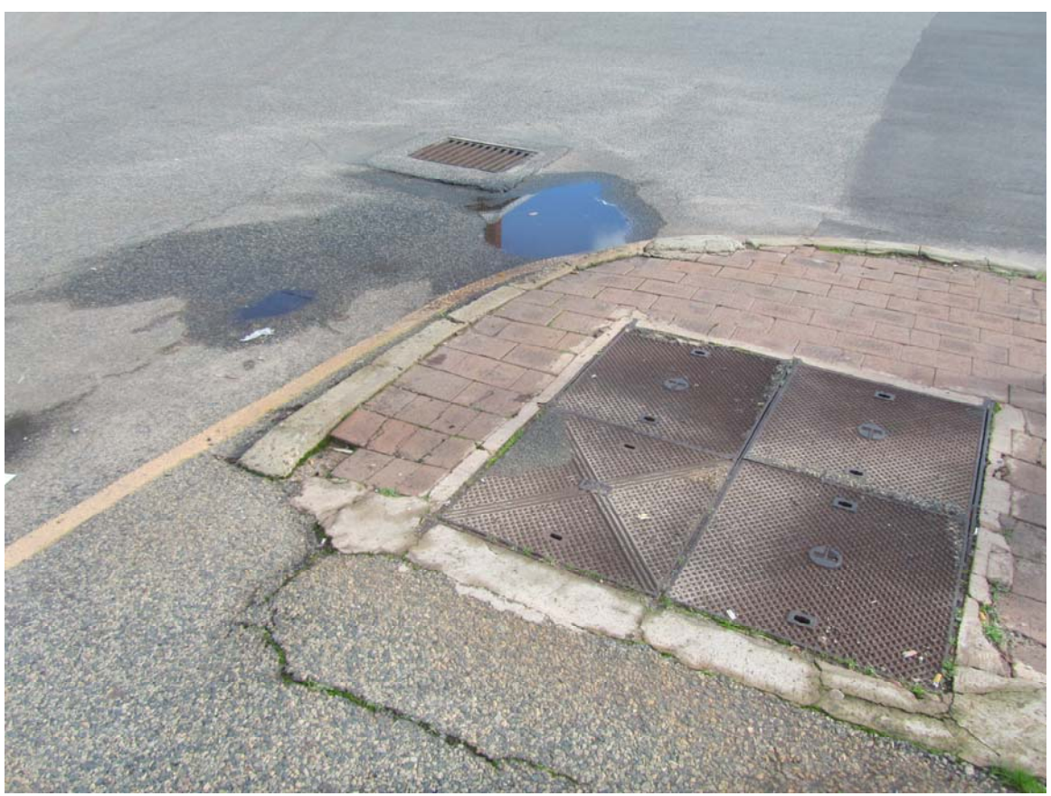
Footpath uneven and needs fixing.