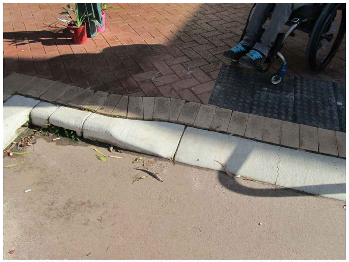
Same problem here as across the road and approx 8 pavers need to be pulled up and re-laid due to the large lip.