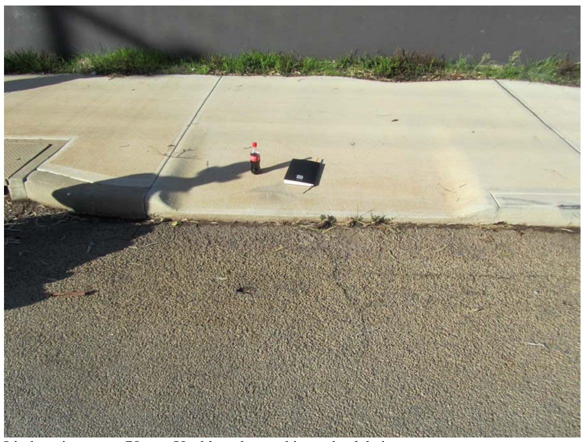
Lip here is approx 70mm. Unable to be used in a wheelchair.