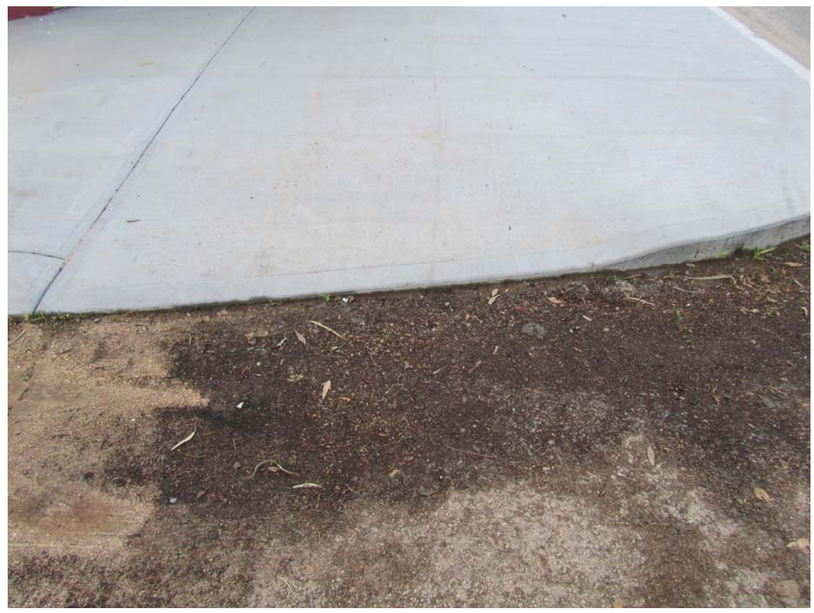
Large lip both sides of Harvey Street between Dolzy shop and old Bank of Australia.