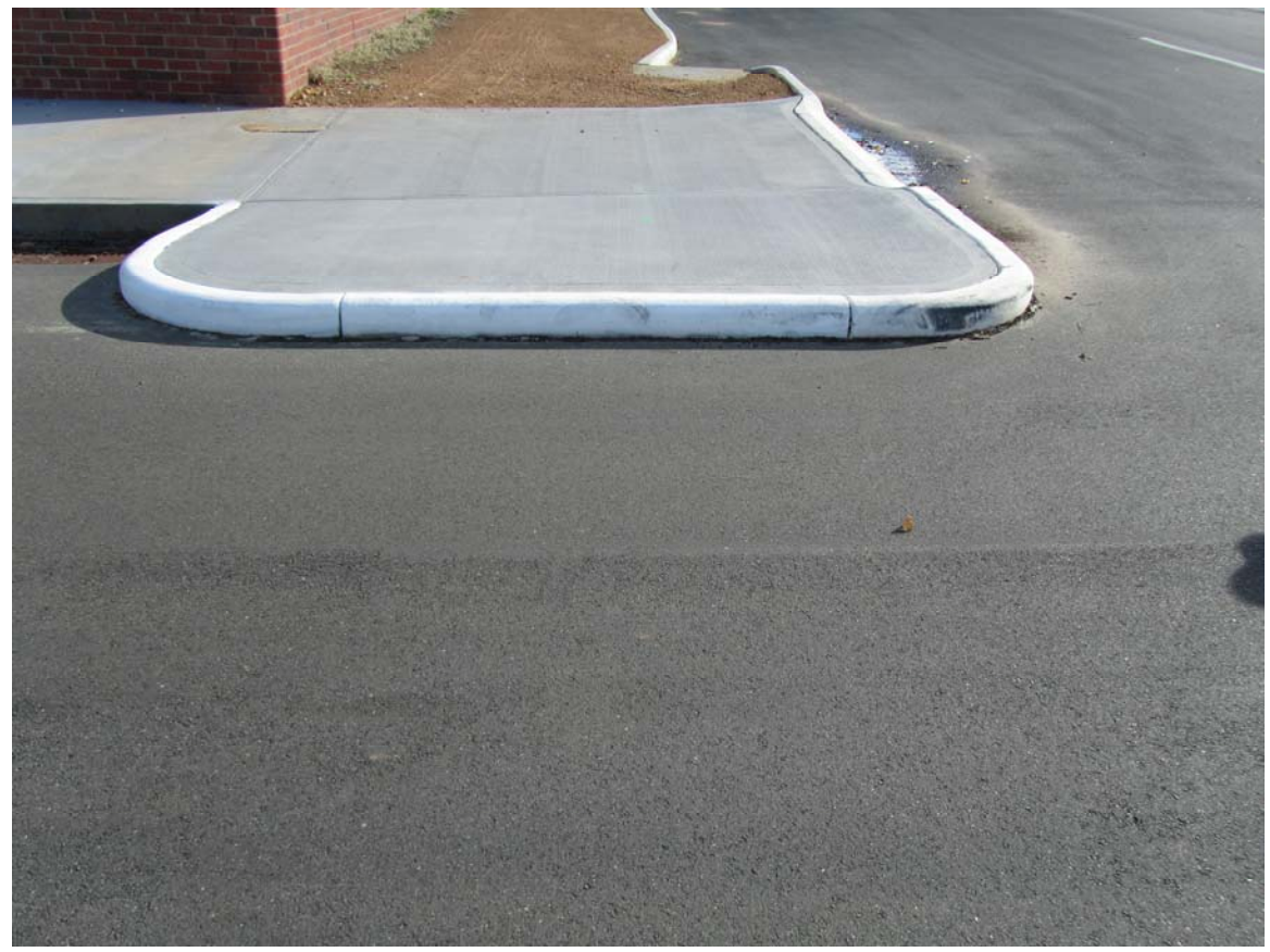
Nice nib no ramp.