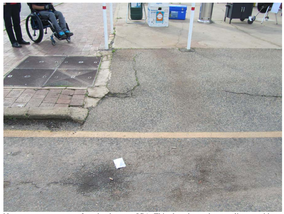
No proper ramp to cross from hardware to IGA. This sloped area does not line up with Ramp at IGA.