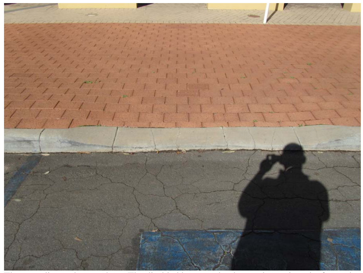
The same lip can be seen here. The disabled bays need to be cut deeper into the footpath to allow users to get their wheelchairs off their cars without being in the path of traffic.