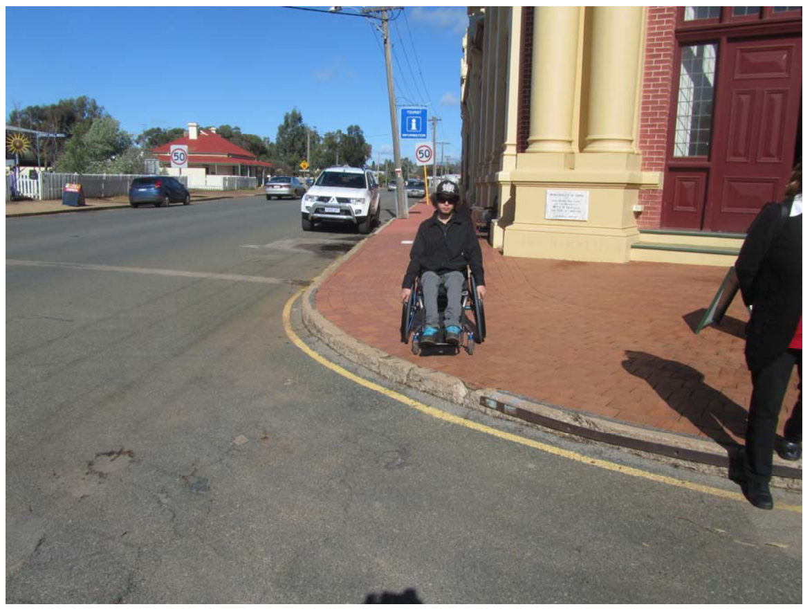
This is where the ramp needs to be situated so a person crossing the road can see oncoming traffic.