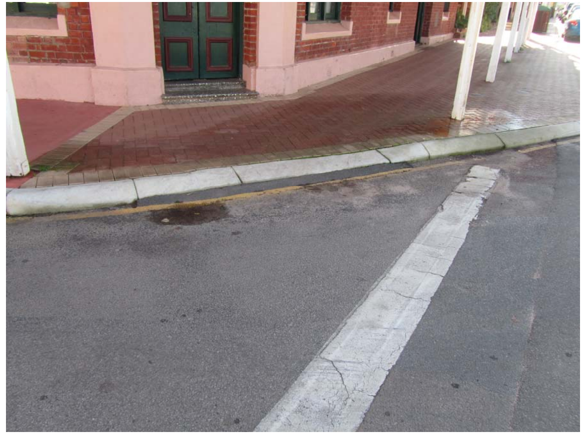
This ramp is on such an angle that users tend to roll when using this ramp.