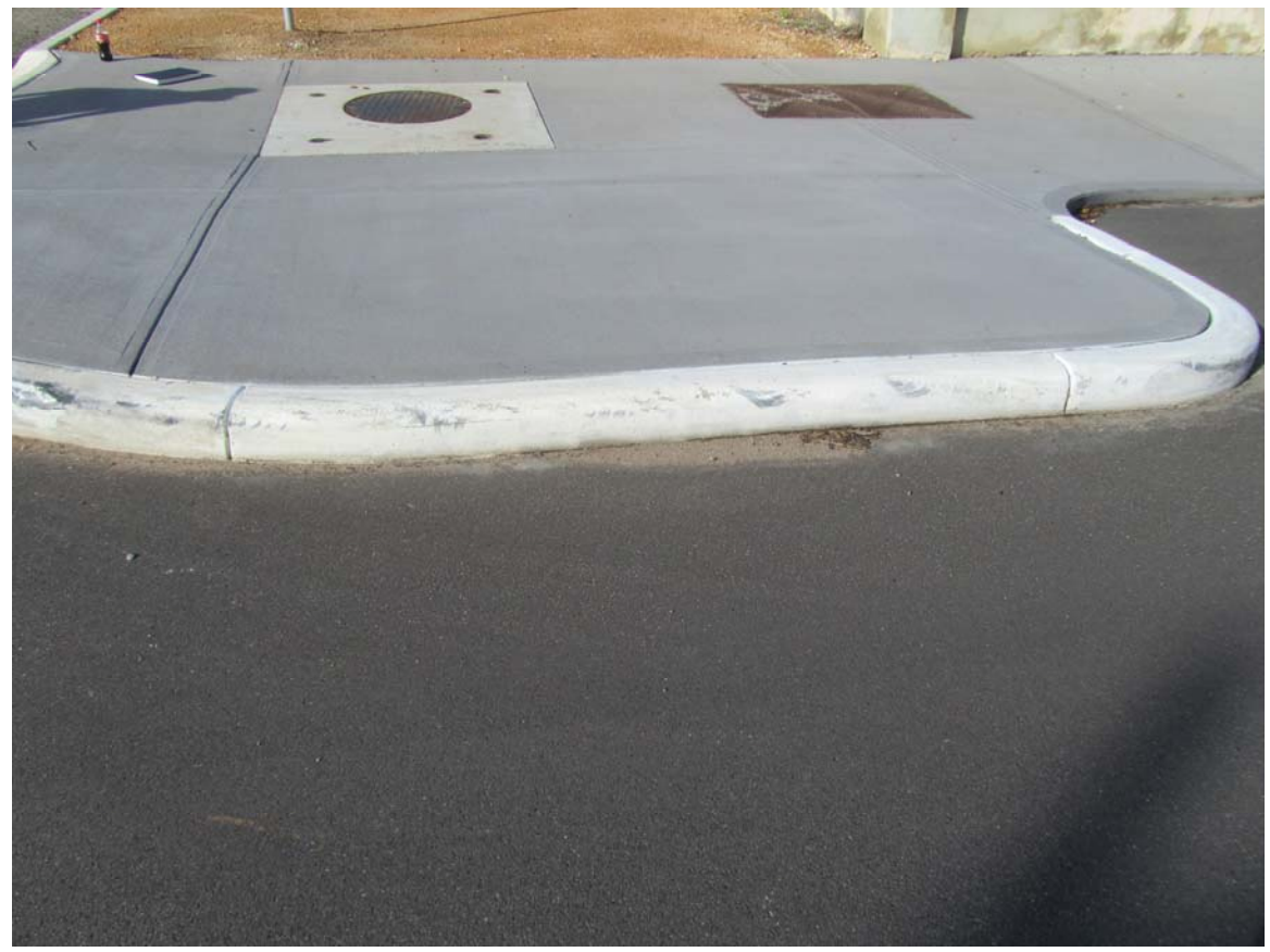
Nice nib no ramp.