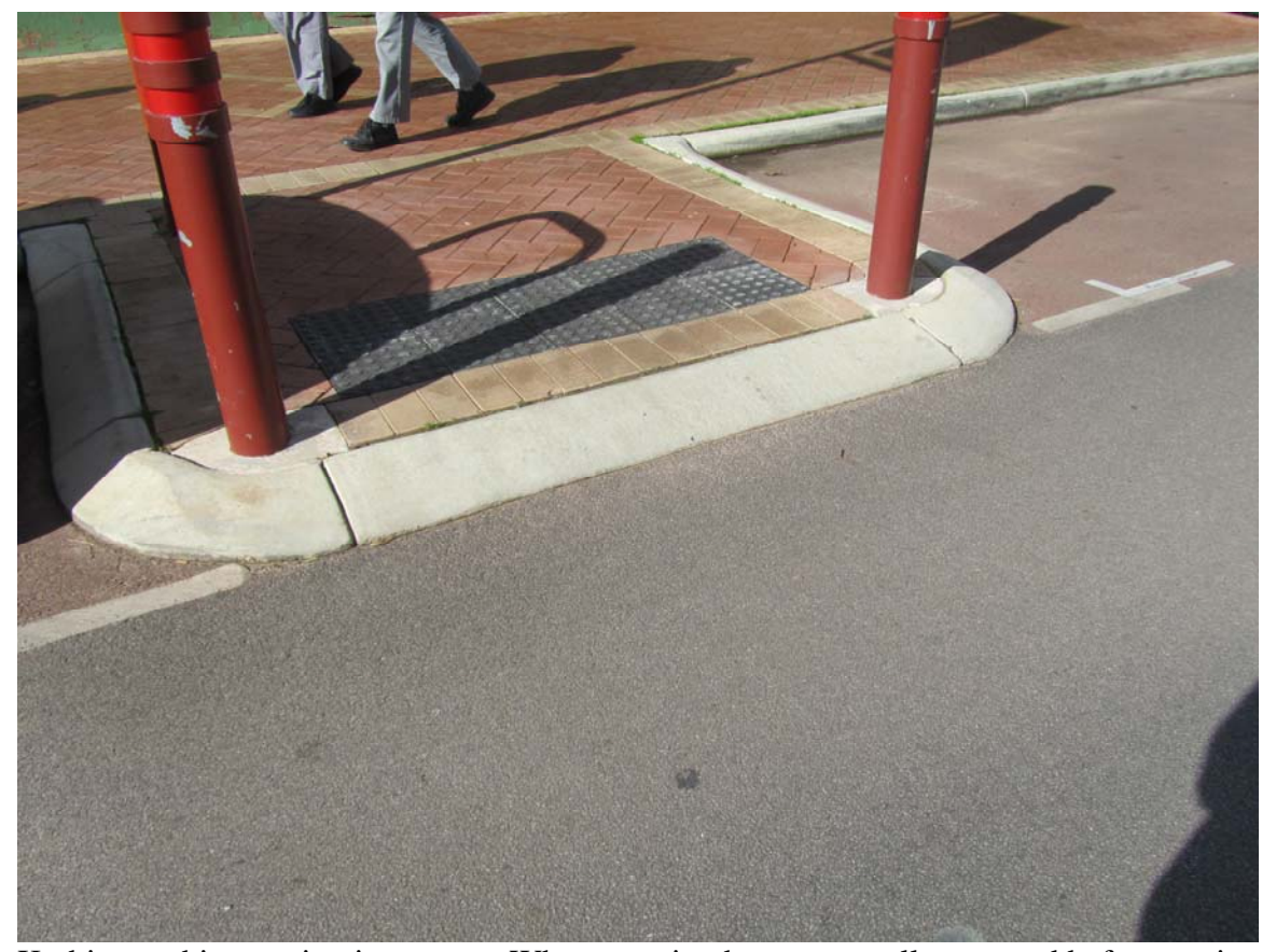
Kerbing at this crossing is to steep. When crossing here users roll onto road before getting a chance to see if a car is coming.