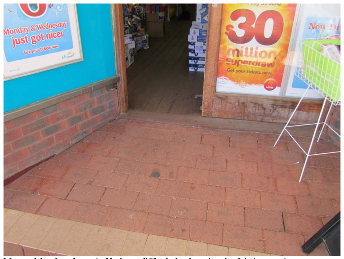
Many of the shop fronts in York are difficult for those in wheelchairs to gain access.