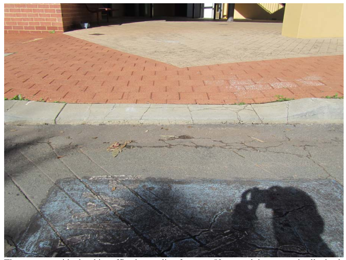
The ramps outside the shire office have a lip of approx 50mm and the rear anti roll wheels on a wheelchair get stuck on a lip of this height.