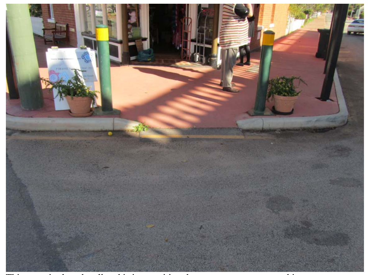
This ramp is sloped well and is in a position that users can see approaching cars.