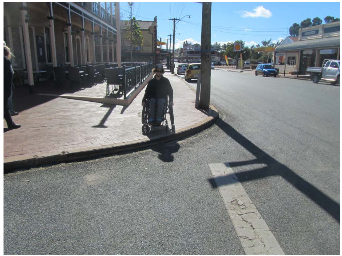
This is where the ramp should be located as to line up with the correct position of the ramp outside the Town Hall.