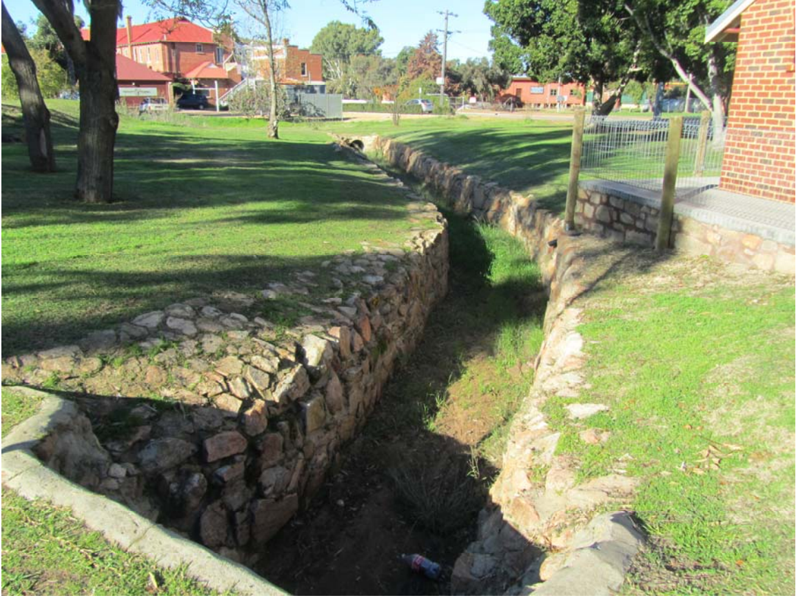
The drain between Howick Street and the Castle needs to have a fence. Very dangerous at night.