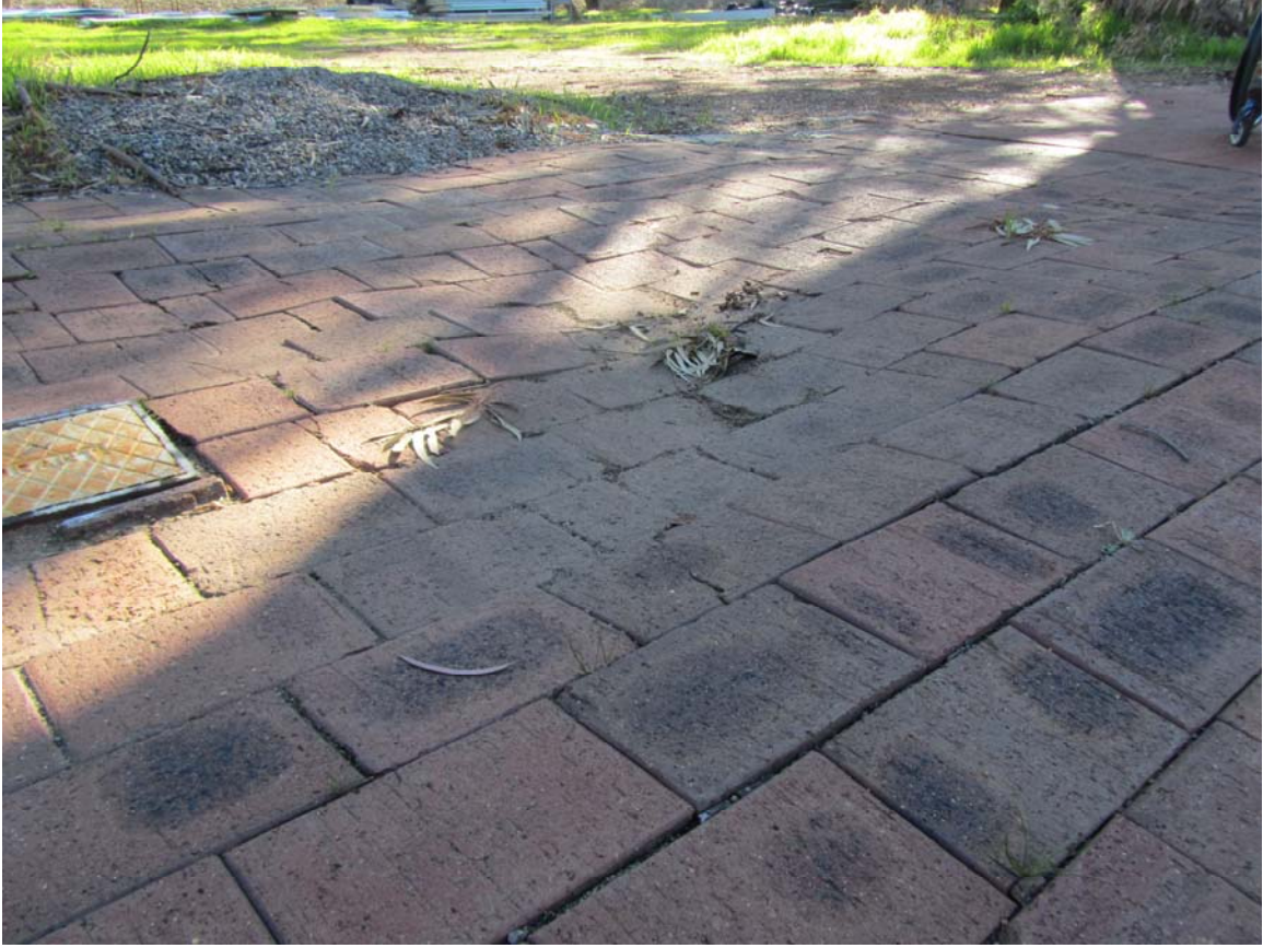
The footpath from Macartney is uneven in many places.