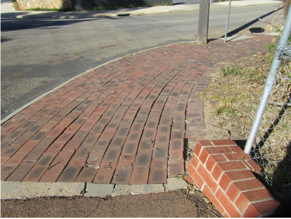
This section of footpath is possible the worst in York. Extremely uneven with a steep angled gradient. Needs to be pulled up and relaid.