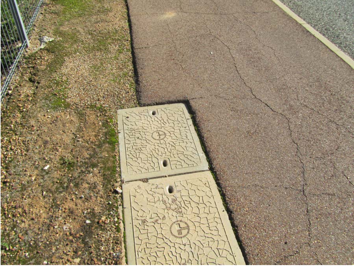
Telstra concrete cover approx 30mm lower than footpath.