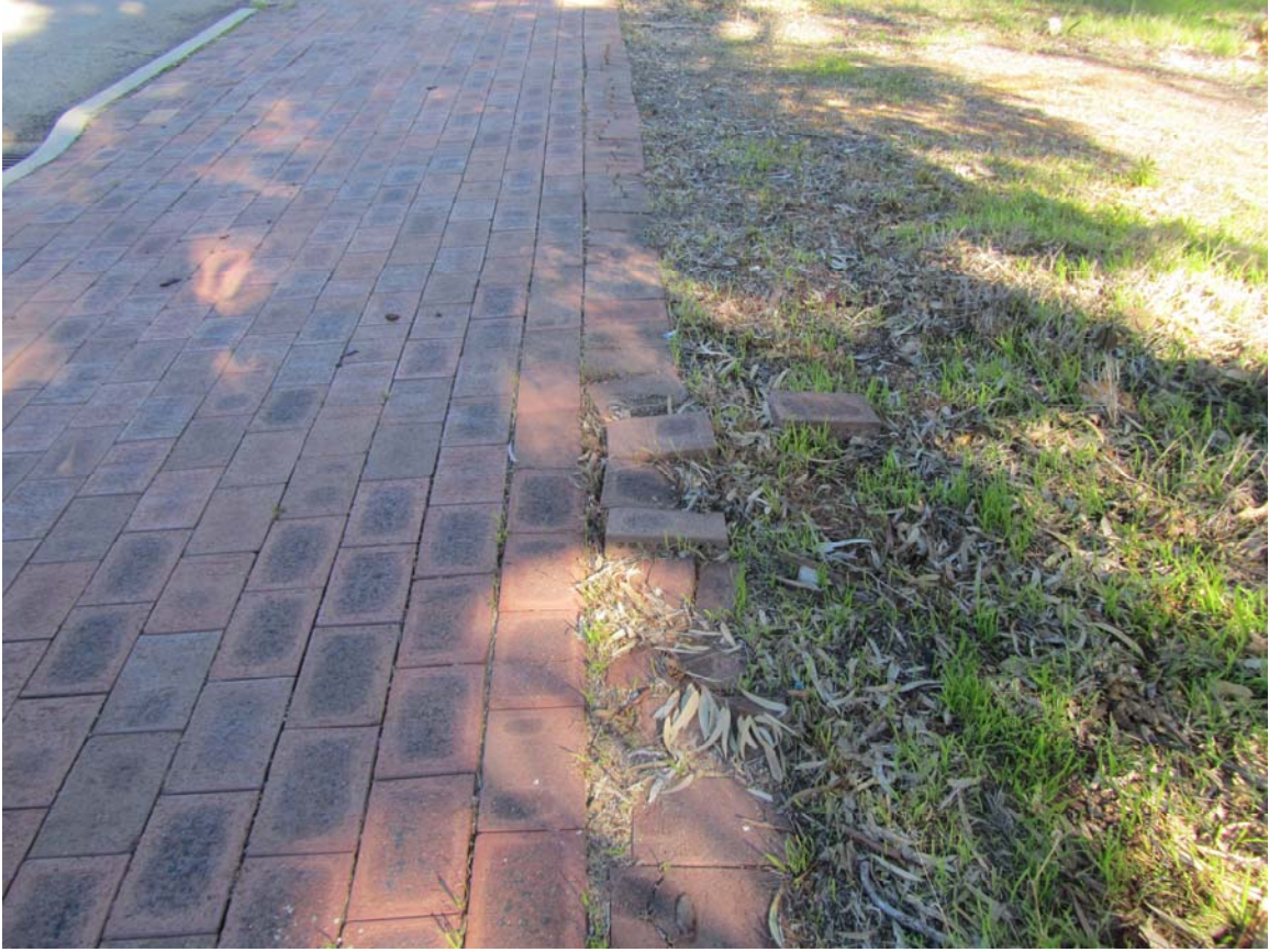
More paving on Howick st that needs fixing.