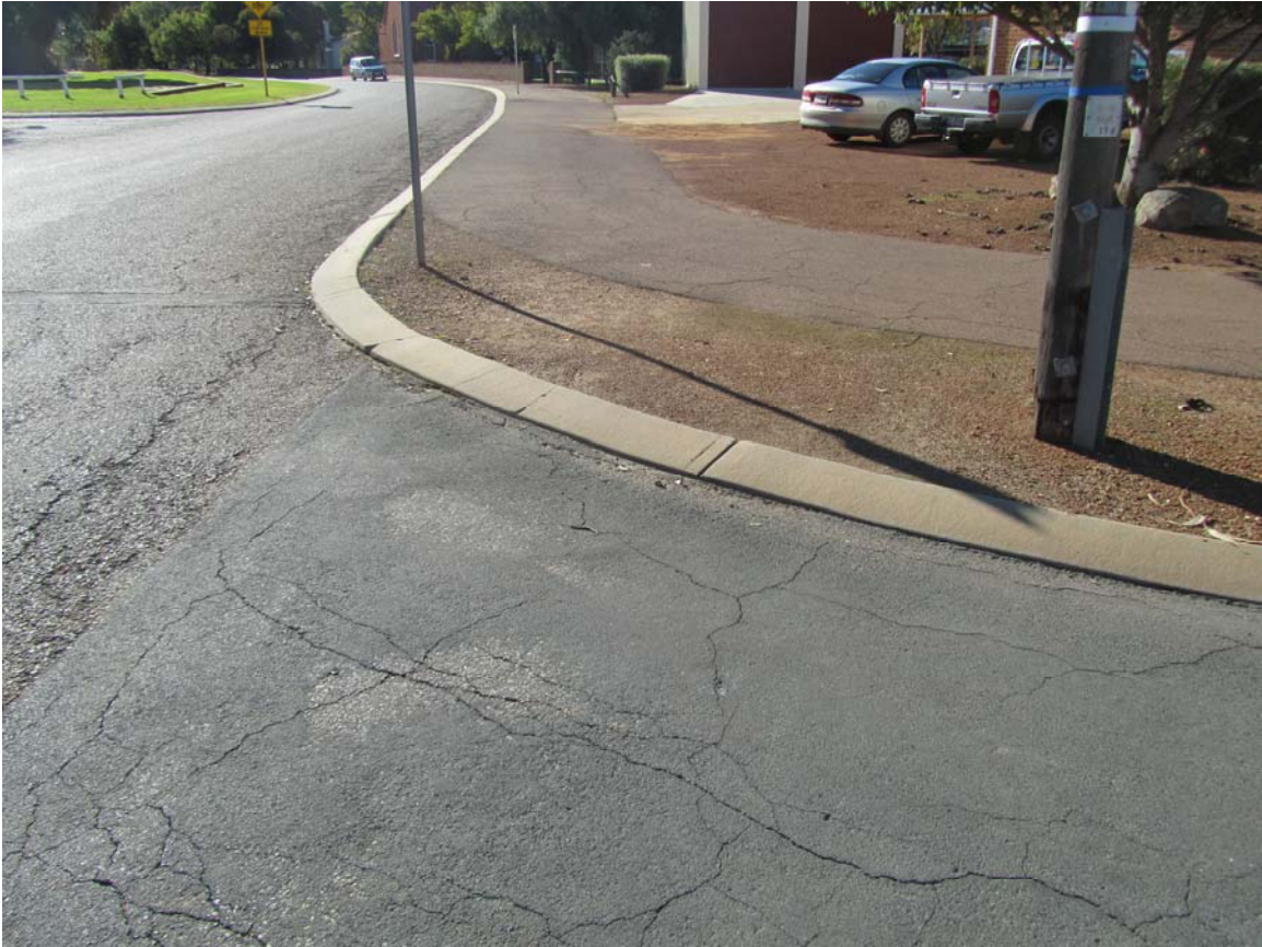
Joaquina and Railway Street intersection does not have proper ramps.