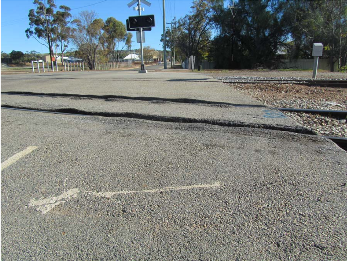
Same problem as Howick street rail crossing.