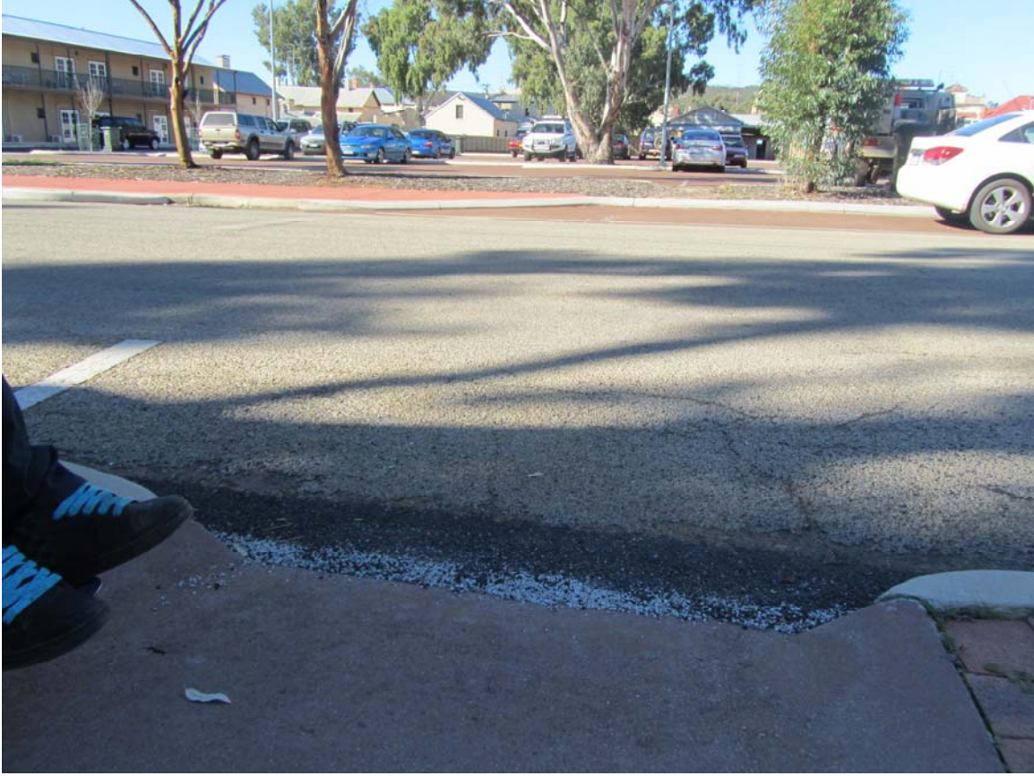
Ramp out the front of doctors surgery that leads across Howick Street to the Settlers carpark has no ramp on the other side.