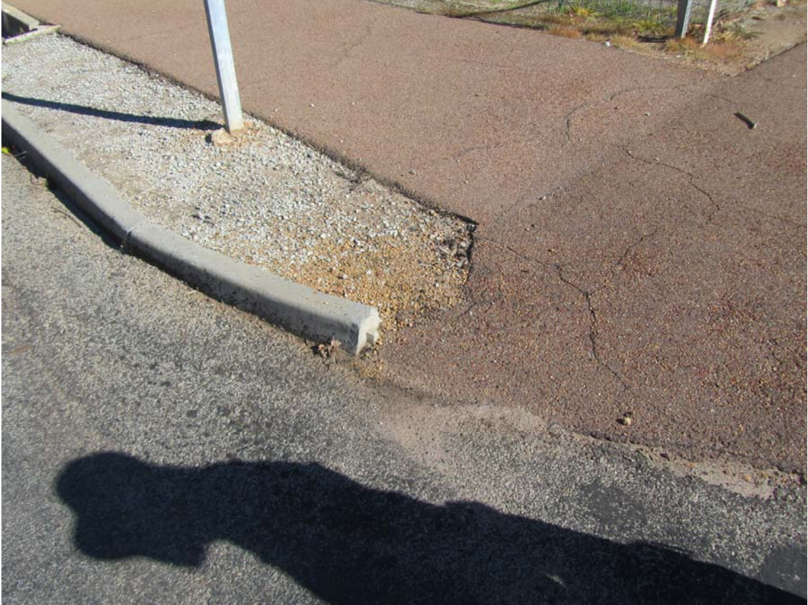
Kerbing cut off straight. Needs to be sloped.