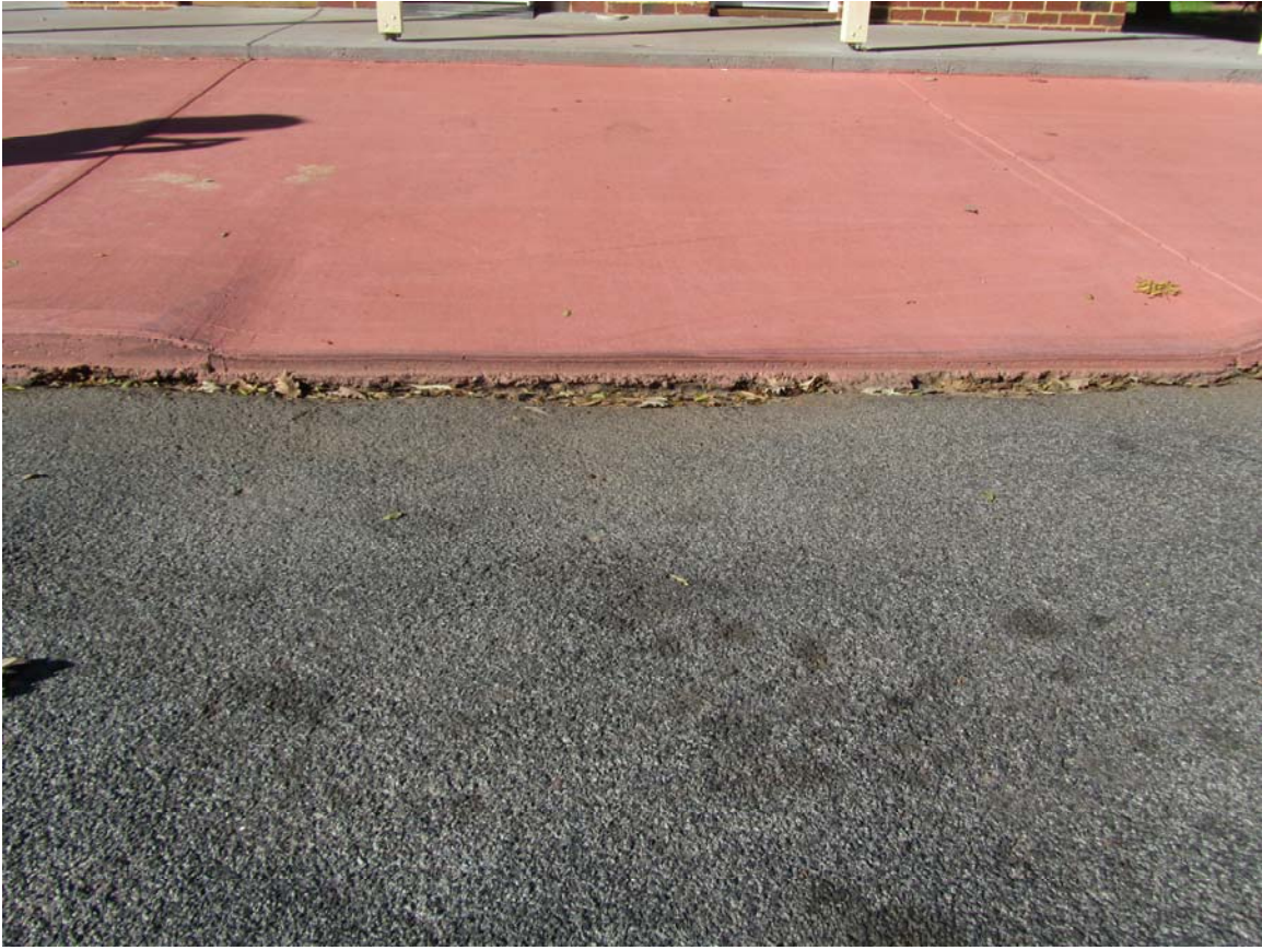
Ramp out the front of toilets is 100mm high and there is no disabled signage on the toilet.