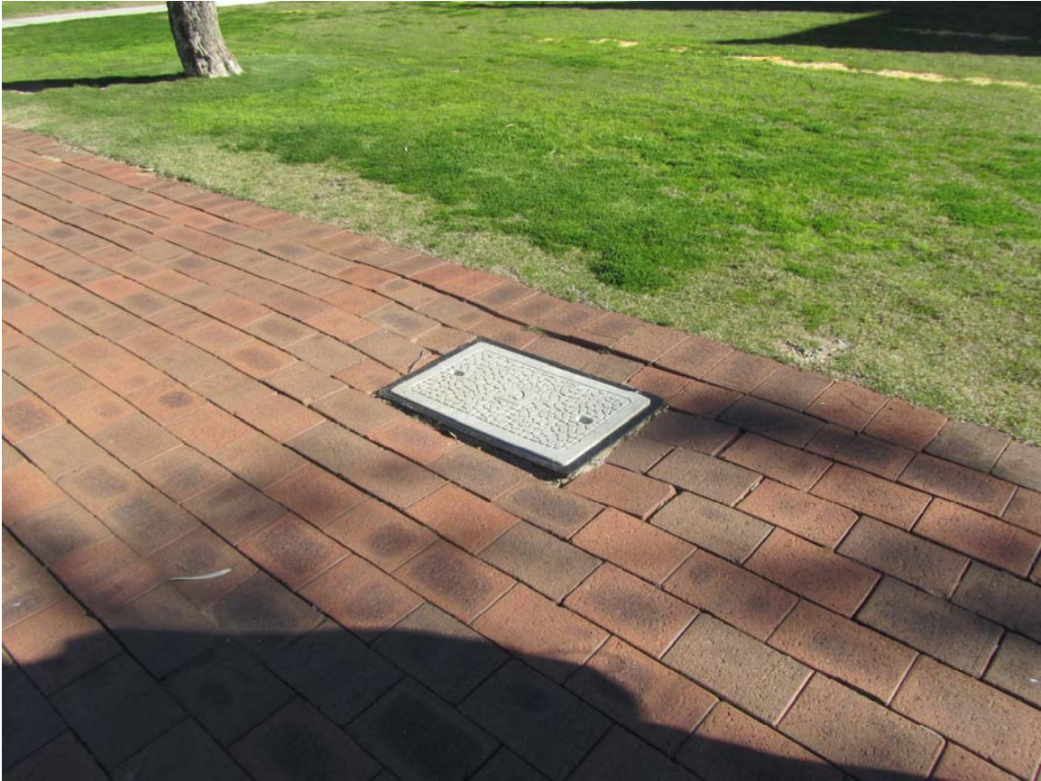
Telstra inspection point too high above paving.