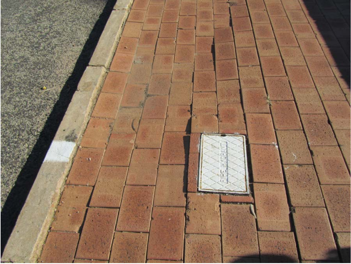
South Street paving very uneven in places.